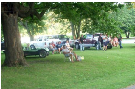
Grand Detour Sat. Night Free Show