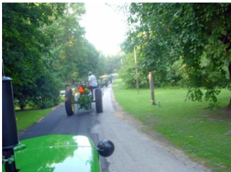
Let the parade begin!